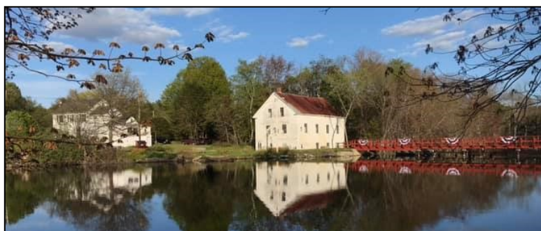
Mill Pond, Wayne.