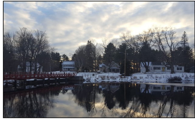
View across Mill Pond