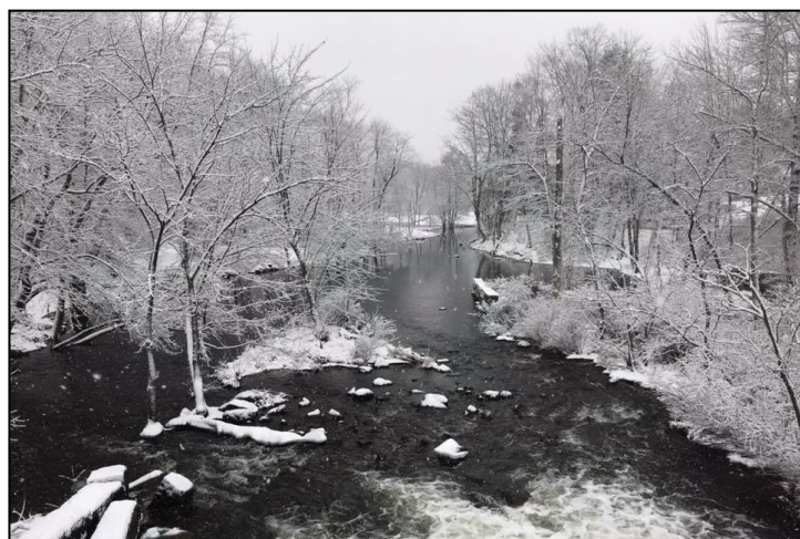
Mill Pond Stream

Please join us for First Saturday at Cary Library's Williams House. Christmas themed books, movies, music and decorations will be on sale at bargain basement prices. While you are here, try our cinnamon buns, scones or quiche. All proceeds benefit the Wayne Library Association. FMI, call 685 3612.