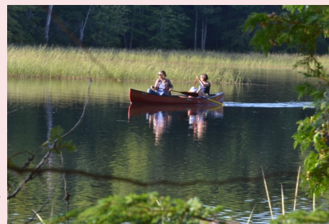
Photo: Cobbossee Stream at the Wakefield Wildlife Sanctuary, West Gardiner

This past fall, KLT renovated two historic cabins at the Trust's Wakefield Wildlife Sanctuary in West Gardiner. We are thrilled to announce that we were selected by and contracted with Maine Cabin Masters for the renovations. Kennebec Land Trust's Wakefield Wildlife Sanctuary and our newly restored cabins will be featured on an episode of Maine Cabin Masters on the DIY Channel!